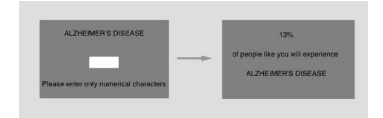
Figure 1: Each trial presented subjects with one of 40 adverse life events and asked for a numerical estimation of the given event's likelihood. Following this estimation, we provided subjects with the base-rate likelihood of the given event.

Priors. A computer program presented participants with each of 40 adverse life events in a random order and asked to give their estimates of the likelihood from 0% to 100% that the presented event would happen to them. Participants made estimates by dragging a sliding bar to the desired number. After providing their prior for each item, participants received the base-rate for that item, which was presented for 4s. Participants alternated giving prior estimates and receiving baserate information until they had completed all 40 items.